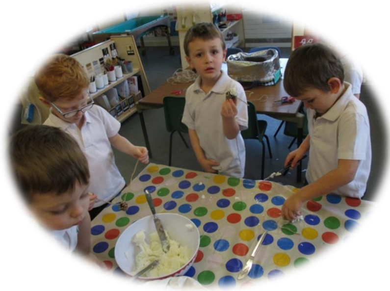
Helping each other to cut the string!